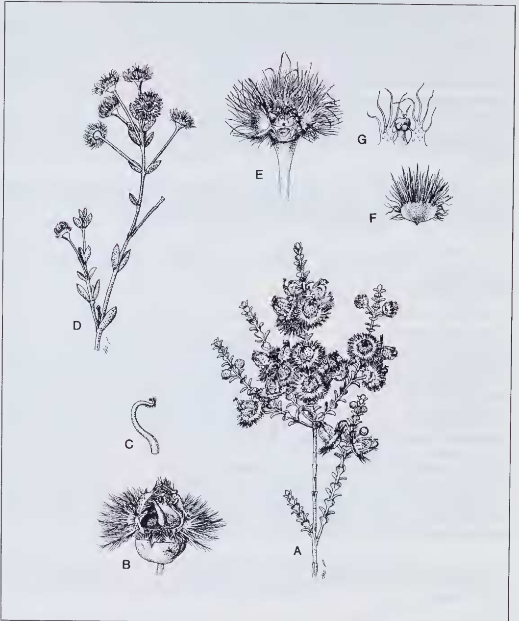
Figure 1. A-C Verticordia aereiflora . A - flowering branchlet (x1); B - flower with 2 sepals and petals removed, bracteoles intact (x3); C - style (x3). D-G Verticordia apecta . D - flowering branchlet (x1); E - flower with 2 sepals and petals and part of hypanthium removed (x3); F - petal (x4); G - a stamen and 2 staminodes (x6). Drawn by Margaret Pieroni.